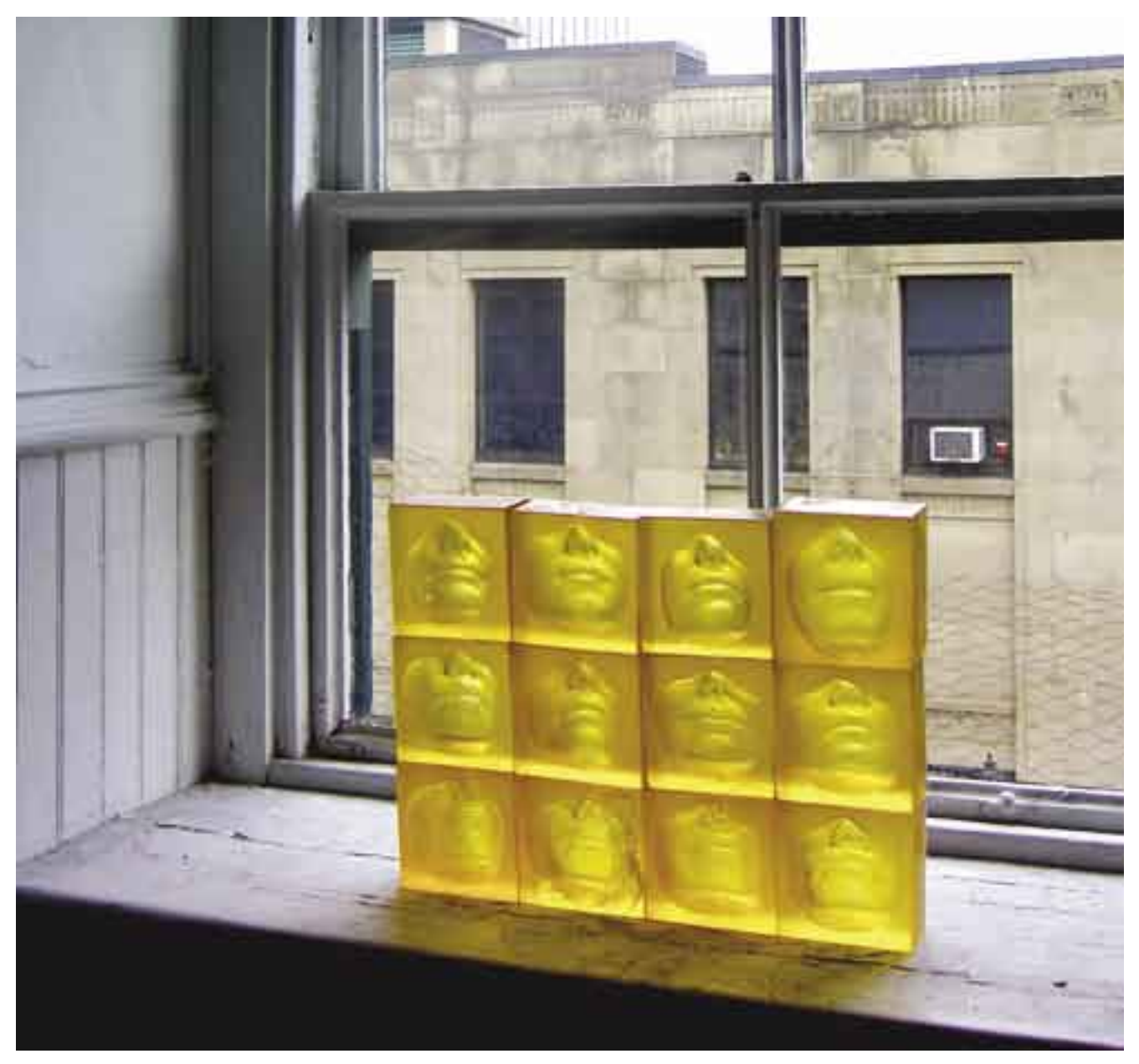
THE ROUTE OF ALL EVIL, 2005 Urethane PMC 780 Dry

Adolf Loos: the new vision. Joseph Rykwert. Studio International, 1973, Volume 186, Number 957.