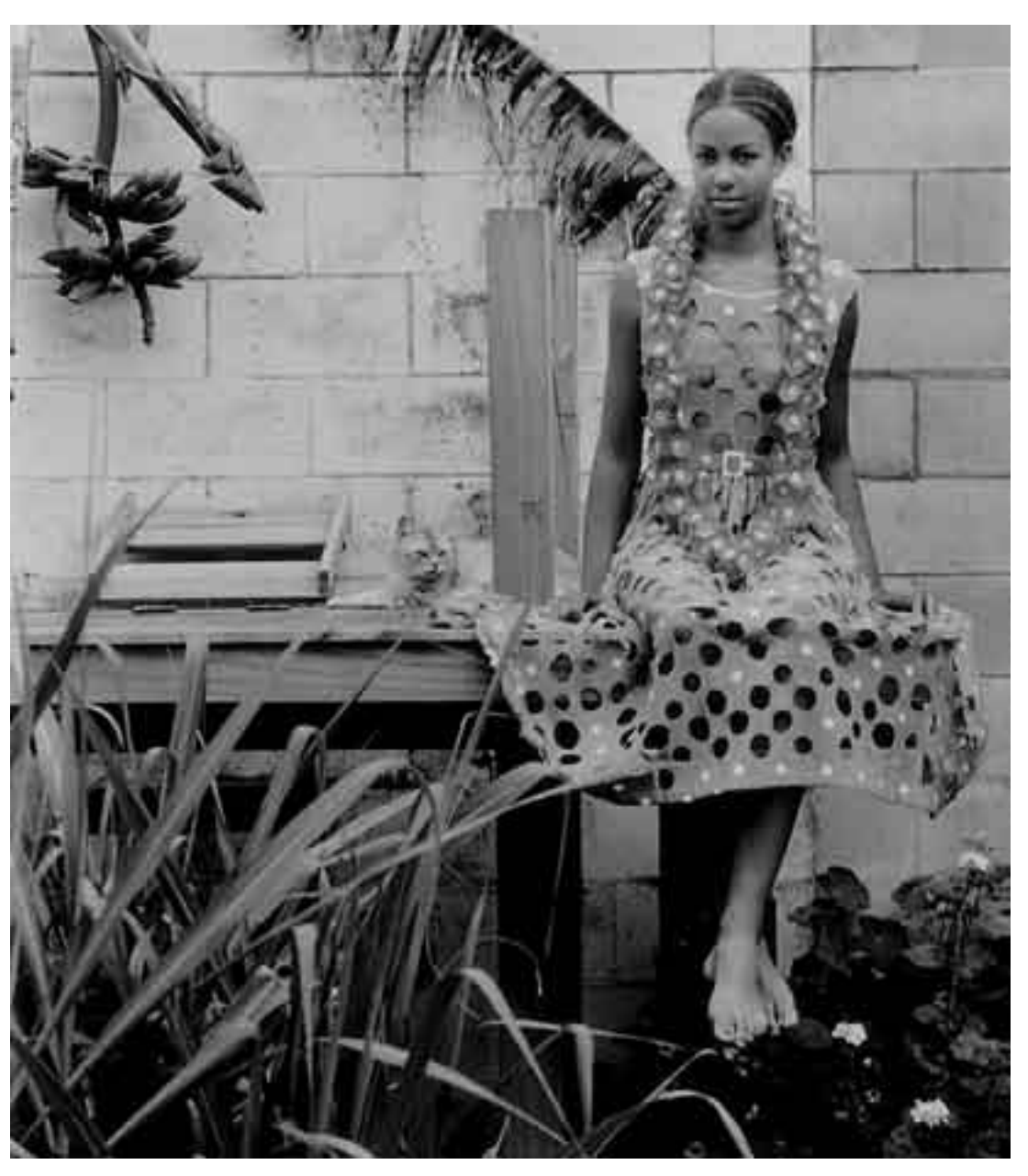
How to make a necklace from a frock, 2005 Mixed media.

Our ability to source and wear a variety of different things is a constant delight and inspiration to me. Explorations into the interface between clothing and jewellery, use and decoration are ongoing. As Julian Schnabel says: 'I work with things left over from other things'.